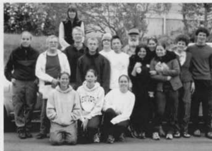
AFS foreign exchange students preparing for backpacking.