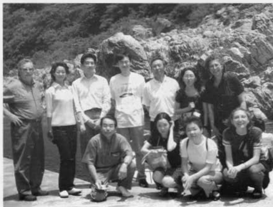
Bottom left: The river trip on the island of Shikoku, Japan, 2002 after Mina's wedding.