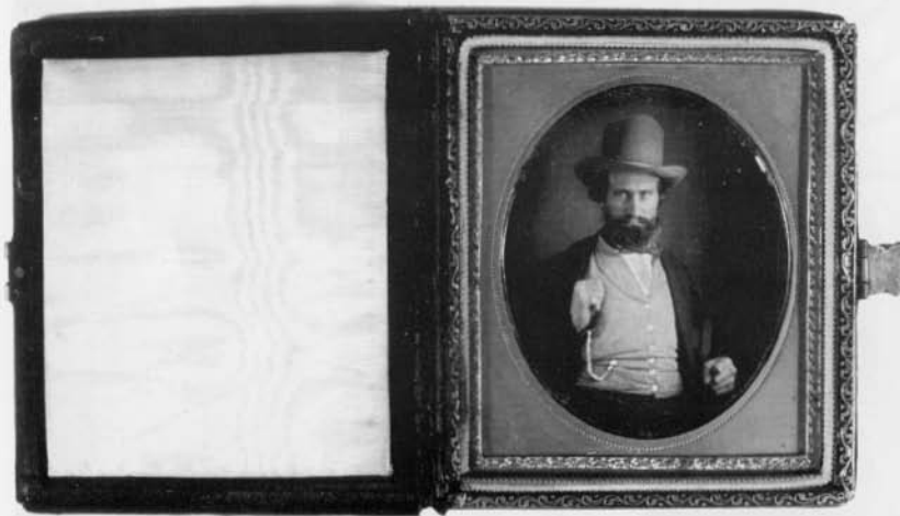
Unknown maker [Gambler?] Sixth-plate daguerreotype, c. 1854

Although I had already spent more than twenty years behind a camera, I had never experienced the photography of my long-ago predecessors. Thus, while I immediately began to collect photography on my own, I lacked direction. Within a few months, I had assembled an unremarkable hodgepodge of items, including cameras, miscellaneous photographic ephemera, and piles of vintage photographs of all kinds. Not surprisingly, I had tumbled headfirst into the most common of all pitfalls that con-