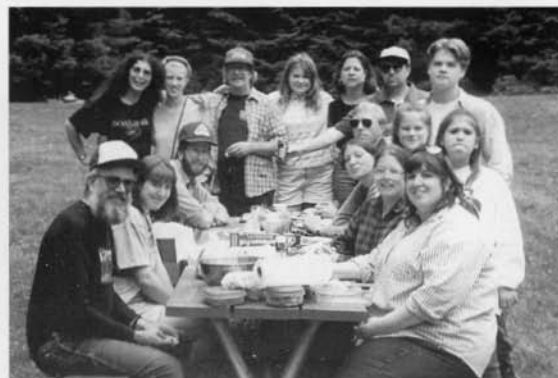
Top right: A family gathering in Redwood Park, 1995.