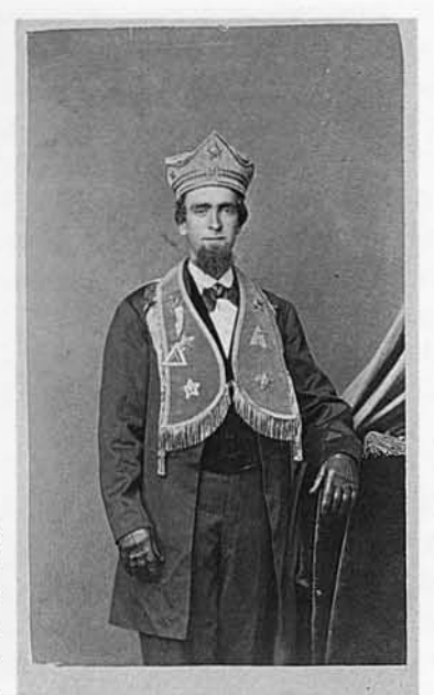
Fig. 3 Carte-de-visite portrait by H. H. Halsey, Dutch Flat, California, c. 1870.