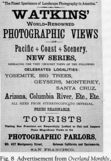
Fig. 8 Advertisement from Overland Monthly February, 1883.

Over the years I have published some 27 books