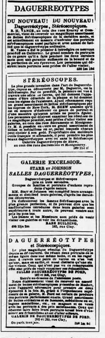
Fig. 2 Advertisements for stereo daguerreotypes from San Francisco newspapers.

The second aspect, which is probably unusual, is that I value any type of information whether it relates directly to photography or not, so long as it can be tied to the life of someone who once worked in Californiaphotography. In practice this means that I try to document an individual's entire life, even if they only spent a brief time in California or in the photographic trade. I am especially interested in those photographers who, unlike Ansel Adams, failed to achieve prominence in their own lifetimes, as well as the role of women in the photographic industry (which ran to at least 20% of the trade by 1910).